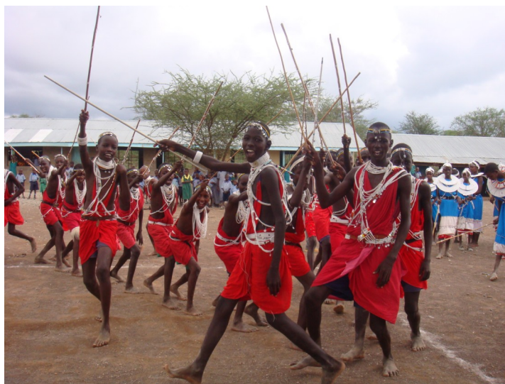
Students perform a traditional Maasai dance

visit for the SERVE/Redemptorist funded project in November 2011. During Anne's visit the rains had come, although communities were still frail and the animals had not yet fully recovered. There was, however, a great sense of hope in both communities and they are now turning to recovery post-drought. It will take months before things return to normal. Although there is no word for 'Thank You' in the Turkana language the thanks and gratitude expressed by the Turkana people was palpable. The Maasai too were extremely grateful for the support received during a particularly difficult drought. Thanks to the support received during the drought both communities can now look to