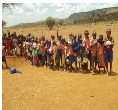
Students of Ilkiloret primary school, Kajiado Northern District, queuing up for lunch

When the rains failed in 2011 it was after a number of years of below average rainfall leaving communities struggling as crop production was minimal, food supplies were low and the animals were dying of dehydration. This left thousands of Maasai and Turkana communities severely malnourished and with deteriorating health.