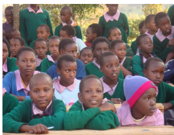
Students from Matasia Primary

Kenya was negatively affected by the severe drought in the Horn of Africa this year. Particularly vulnerable to the drought were the nomadic pastoralist communities, including the Maasai and the Turkana, whose livelihoods rely upon their herds of livestock, either cattle, goats, sheep, camels, or donkeys, for survival. The Maasai's home is Kajiado County, South of Nairobi. Turkana County, North West Kenya is home to the Turkana. Both counties are semi arid ('desert like'). Traditionally the Maasai and Turkana move with their livestock from pasture to pasture depending on the availability of water.