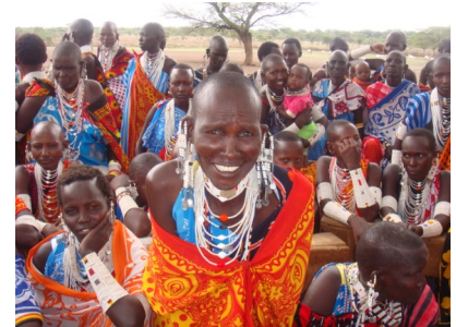
Parents from Endoinyo Olasho Primary School